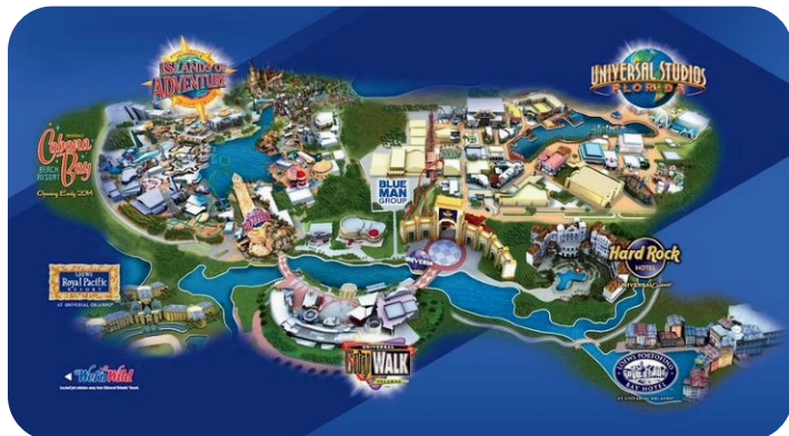
Map Of Universal Studios, Orlando, Florida

Meal: Breakfast + Lunch + Dinner (Included)