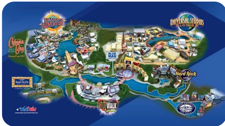
Map Of Universal Studios, Orlando, Florida

Meal: Breakfast + Lunch + Dinner (Included)